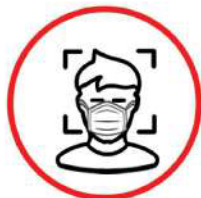
Face Mask Detection