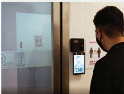
Office / Commercial Building